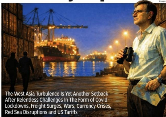
The West Asia Turbulence Is Yet Another Setback After Relentless Challenges In The Form of Covid Lockdowns, Freight Surges, Wars, Currency Crises, Red Sea Disruptions and US Tariffs

While shifting focus to the domestic market may work for certain agro commodities, it is far less viable for sectors such as ceramics, brass parts, engineering goods, gems and jewellery, textiles and pharmaceuticals.